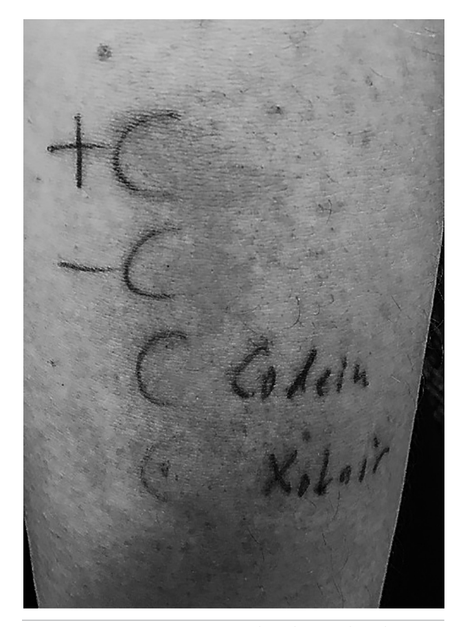
Figure. Skin prick test with histamine (0.1%), saline (0.9%), codeine (0.9%), and omalizumab (Xolair, undiluted) after 45 minutes.

The patient herself and the attending pulmonary physician assumed that this was probably not a reaction to mepolizumab but an asthma exacerbation that had occurred many times before the biologic. She was subsequently referred to us with a request to continue mepolizumab therapy for severe asthma in our center. Three weeks later, after discussion with the patient, we performed a prick test with undiluted mepolizumab. As the test was negative after 20 minutes, we injected mepolizumab 0.3 mL (about 35 mg) subcutaneously.