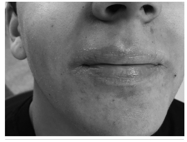
Figure. Upper and lower lip cheilitis.

Skin prick tests with a locally adapted battery of aeroallergens were positive to Penicillium species and grass pollen. Specific IgE results (ImmunoCAP, Thermo Fisher Scientific) were as follows: Penicillium notatum (7.13 kU<sub>A</sub>/L